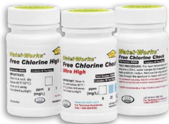
SenSafe Free Chlorine Test Strips are available in bottles of 50

Free Chlorine test strips combine a variety of detection ranges with a patented free chlorine indicator. They are perfect for determining whether or not you have the correct amount of sanitizer present, and for determining the amount of Vita-D-Chlor needed to dechlorinate potable and mildly chlorinated water.