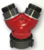
4" FNST Wye for attaching two NEMA-200s off the pumper port