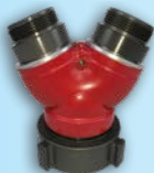
4" FNST Wye for attaching two NEMA-100s off the pumper port