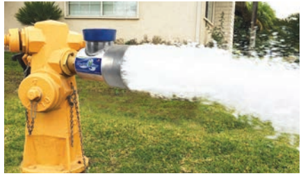
ZDe-Chlorinator is available with either a removable elbow or permanent diffuser.