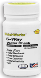
WaterWorks 5-Way test strips are available in bottles of 50

WaterWorks 5-Way test strips report results for free chlorine, total chlorine, pH, total alkalinity and total hardness — all on the same strip. Utilizing a single dip-and-read method, these strips offer accurate and reliable results in less than 30 seconds.